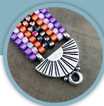
Matubo 10/0 Cylinder