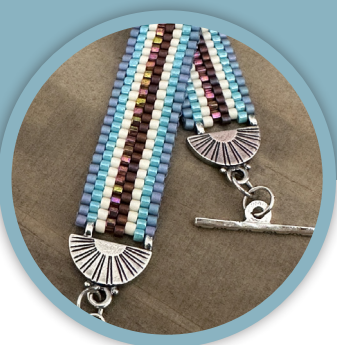
Miyuki 10/0 Delica