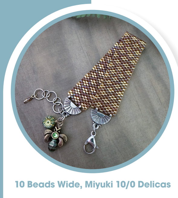
10 Beads Wide, Miyuki 10/0 Delicas

Using even-count peyote stitch, create a repeat of the following pattern to desired length. Be sure to leave a 10-inch tail to start, and finish with enough thread to sew on the finding. Refer to Page 2 for instructions to sew on the finding.