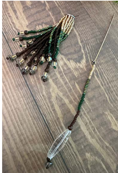
Holes 6 - 15 worked Eye Pin Strand worked