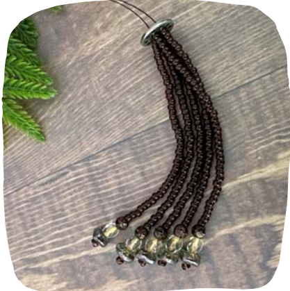
Holes 1 - 5 worked