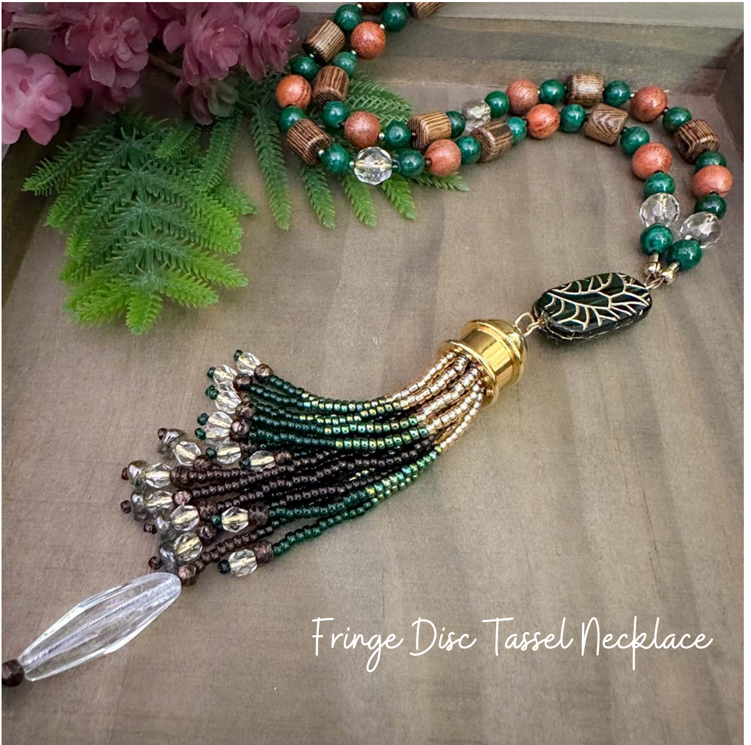
Fringe Disc Tassel Necklace